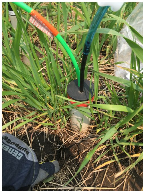
A lysimeter installed in Lincoln-Pipestone

Note: Kernza does need to be fertilized in order produce economically-viable grain yields over the 3 years for which it is typically harvested, but at the time this trial was initiated, more data from plot-based trials was needed to confirm that Kernza planted on Wellhead Protection land could be fertilized without contaminating groundwater. Since the completion of these field trials, a plot experiment in the Central Sand Plains region of Minnesota found that soil water nitrate concentrations remained very low even under Kernza fertilized at 100 kg N/ha (about 90 lbs N/ac). With this new evidence, next steps will include fertilized field trials.