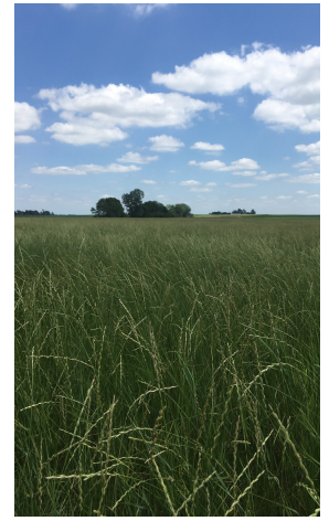
Pipestone - Evelyn Reilly

Biomass and grain yields were within expected ranges for unfertilized Kernza. Combine-harvested grain yields in 2020 were 250 lbs/ac in Pipestone and 468 lbs/acre in Chatfield. Straw yields, estimated by quadrant sampling, were 4.5 and 2.5 tons/ac in Chatfield in 2019 and 2020, respectively, and 2.2 and 1.9 tons/ac in Pipestone. A new Kernza variety, MN-Clearwater, has since been released, which produces higher grain yields than the variety used in this study.