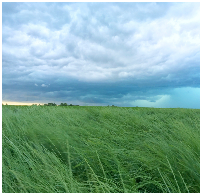
Stormy skies over a Kernza field in Chatfield, MN

Soil water samples were collected from a portion of the city planting, along with grain and biomass yields and data on soil moisture. Nitrate levels in soil water were nearly 0 ppm, indicating that little nitrate was being lost through leaching, and that Kernza production could be a promising option for crop production on vulnerable land.